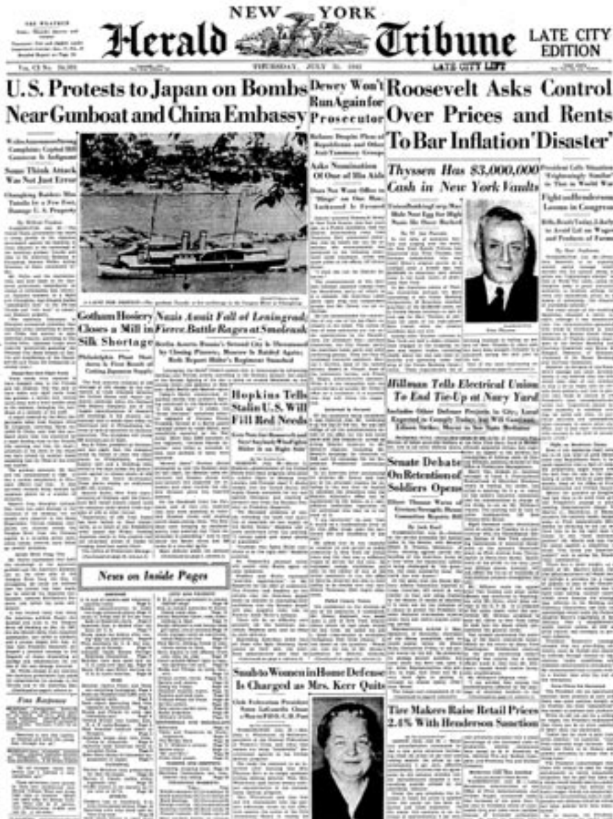
The front page of the New York Herald-Tribune , July, 31, 1941.

The Thyssen/Union Banking article was continued on page 22 in the financial news section, with three almost full columns plus another full column ancillary story on Thyssen. The articles are reproduced in full in the following pages.